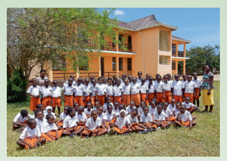
At present 525 pupils (nursery school to 7th grade) are taught in our primary school.

More and more pupils benefit from reduced school fees and the free transportation.