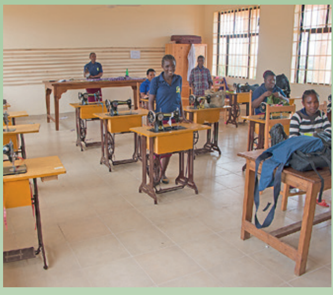
The classrooms are now very well equipped.