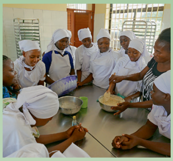
The well-equipped bakery delights the eleven future bakers.

course of further education on the production of Swiss Christmas biscuits. We were offered to produce Swiss Christmas biscuits for the Swiss Ambassador's guests at the Embassy.