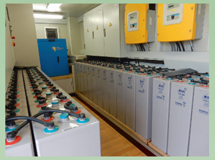
New batteries were installed and since February our solar system provides the electricity for the orphanage and our school.