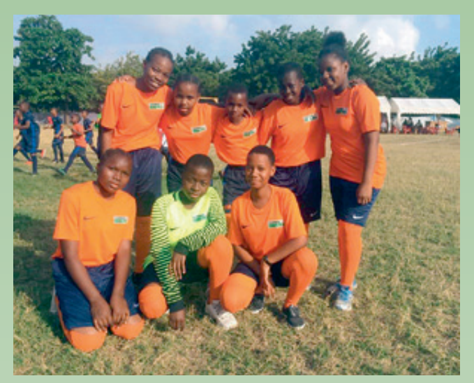
The football tournament from the foundation help2kids: Our girls proudly wore the new Tuwapende Watoto football dresses and earned the third final rank.