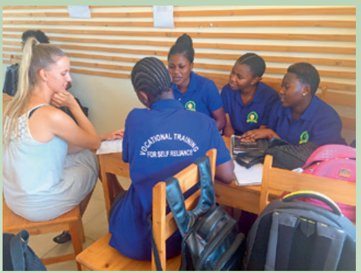
Our volunteers teach French for the bakers/food production apprentices. This improves the chance for a good job for the learners.