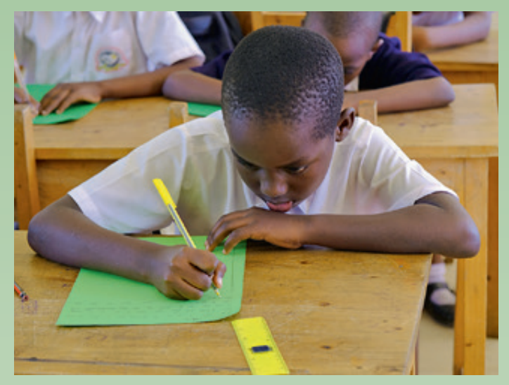
The children have pen pals with students from Switzerland: With great joy, they return letters from Swiss school classes.