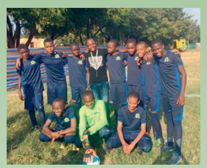
Football tournament from the foundation hel2kids: The boys were very excited about the new football uniform and reached the final match.