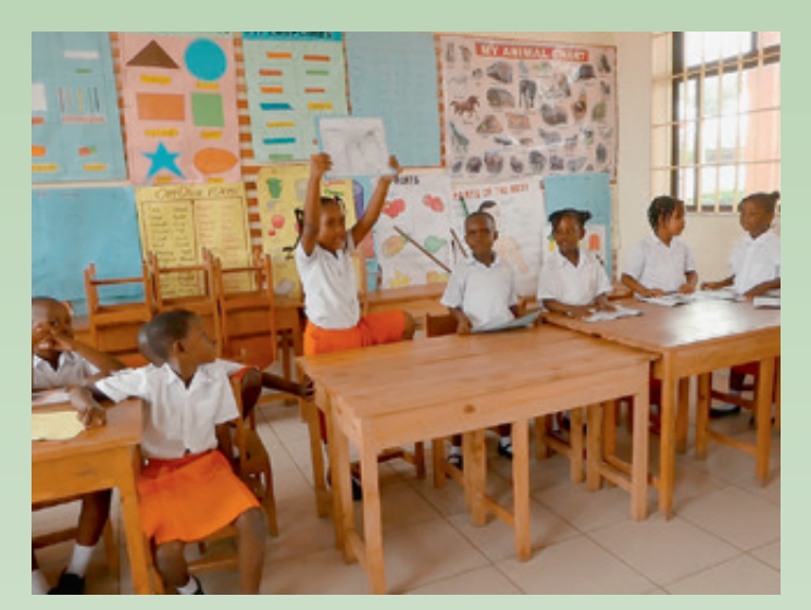
Grade one students are very proud to show their English skills to parents and visitors.