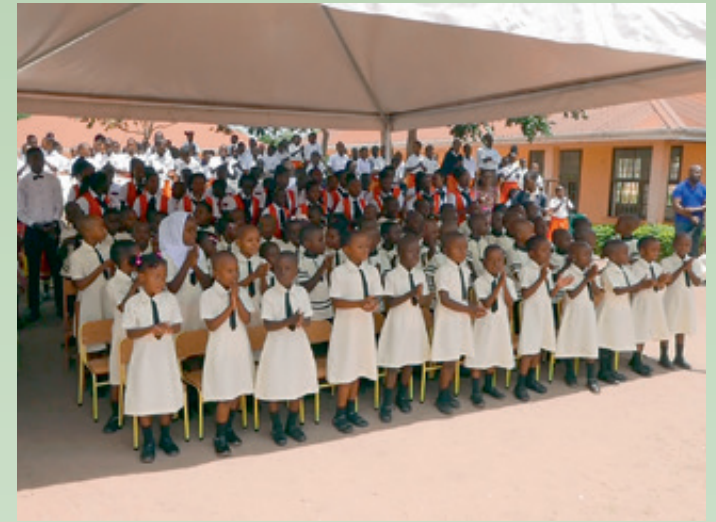
66 nursery students and 33 primary school grade 7 students received their certificate.