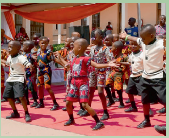
In an impressive way, the nursery pupils talked about the different food in Tanzania and their nutritional values.