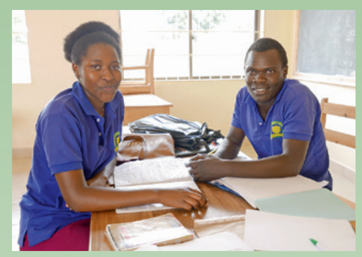
The horticulture apprentices diligently prepare for the National Examination after completing a highly successful internship in Moshi, in the north of Tanzania.