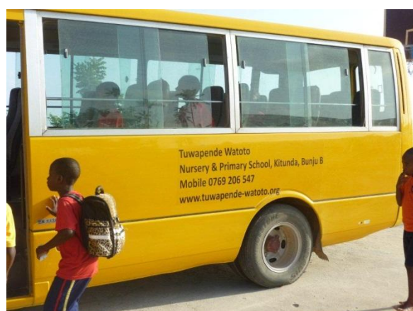
The Tuwapende Watoto bus was repainted yellow in accordance to tanzanian regulations.