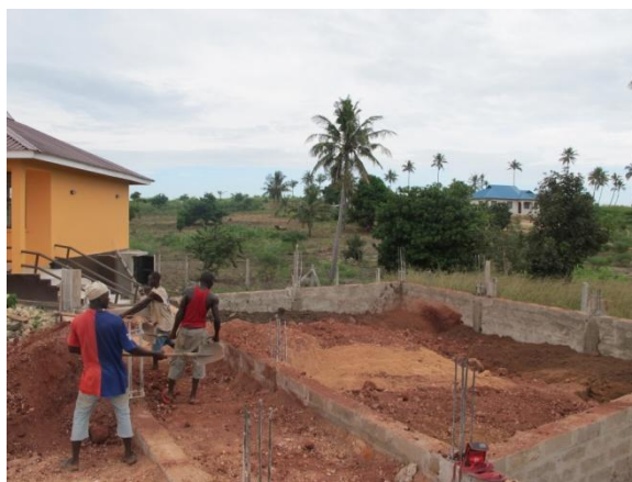
Work on the final construction phase of school class buildings has started in April 2012.