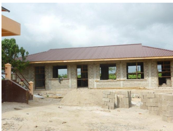
January 2012: Front view of the new kitchen and dining hall during construction.