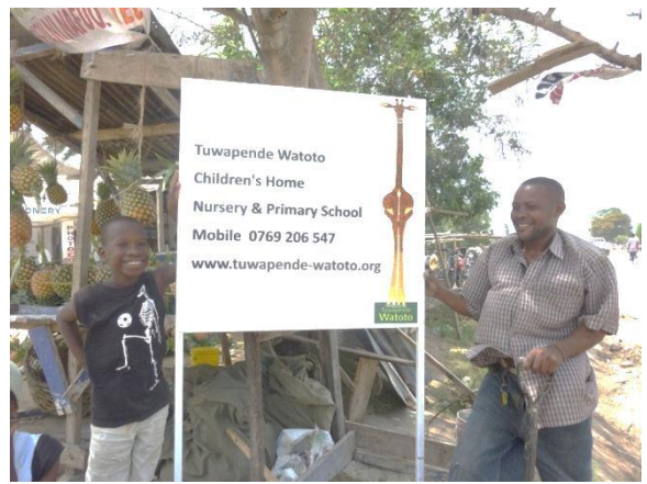
New signposts indicate the way from the main road to our premises.