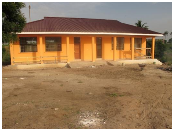
April 2012: Front view of the new 2-classroom building.