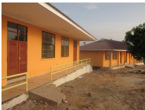
April 2012: The kitchen and dining hall as well as the new 2-classroom building are almost completed.