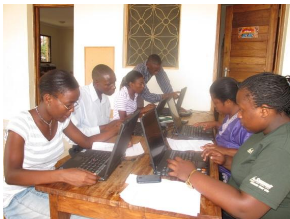
At Tuwapende Watoto we also provide education for the staff: IT training with Kaka Ema.