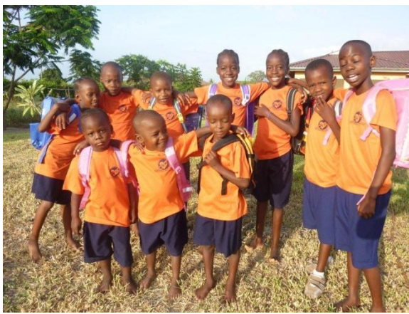
On Fridays the children wear the sports uniform.