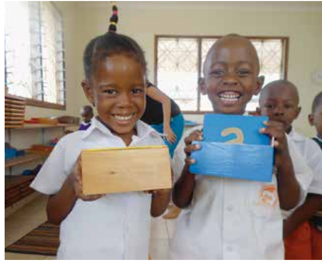
Nursery pupils are proudly showing their new Montessorri learning aids which were bought for the new nursery class.