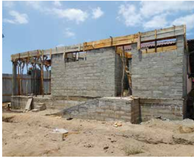
The new home kitchen should be terminated and operational by end of December 2013.