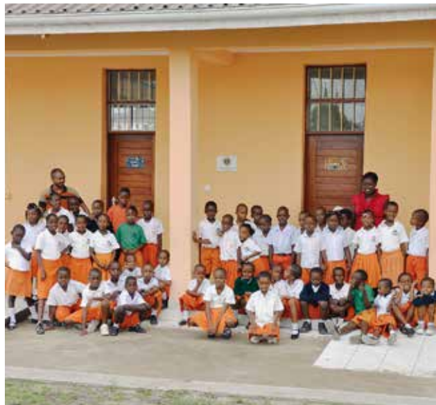
The pupils of grades 2 and 3 in front of the classrooms sponsored by the Lions Club Willisau.