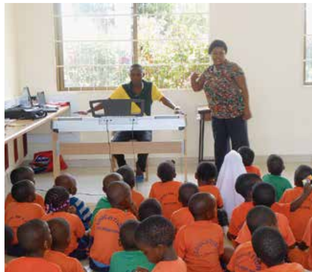
Since September 2013, music lessons are part of the regular timetable at Tuwapende Watoto nursery and primary school.