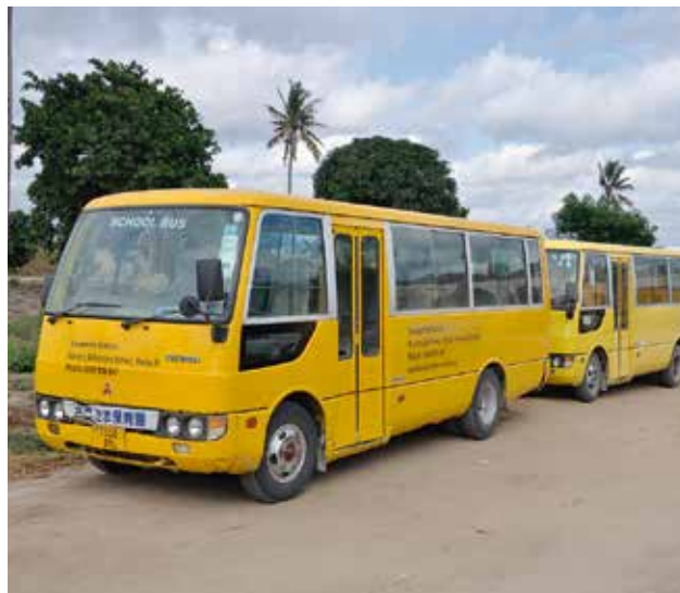
In July 2013 our third school bus was put into operation and a new school bus driver was employed.