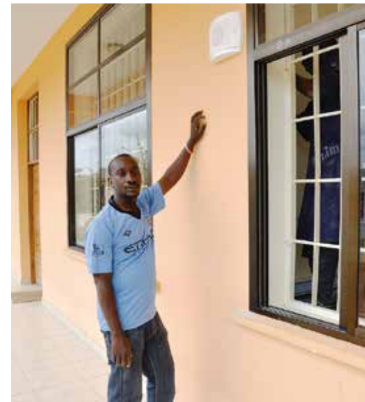
The new school bell system was kindly donated by Kretschmer Informationselektronik GmbH.