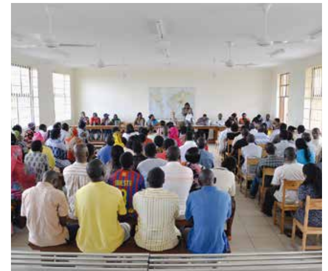
110 parents actively participated in the four hour parent's meeting in July 2013.