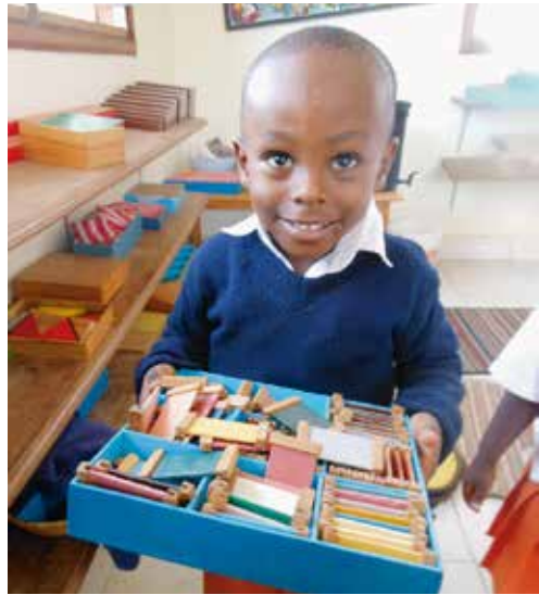
All Montessorri nursery aids are made in Tanzania by the International Montessori Child Care Collage.