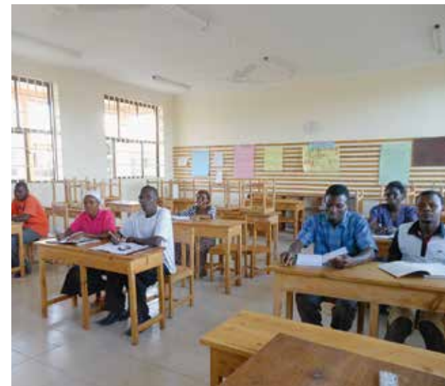
Employees of Tuwapende Watoto attend English classes after work.