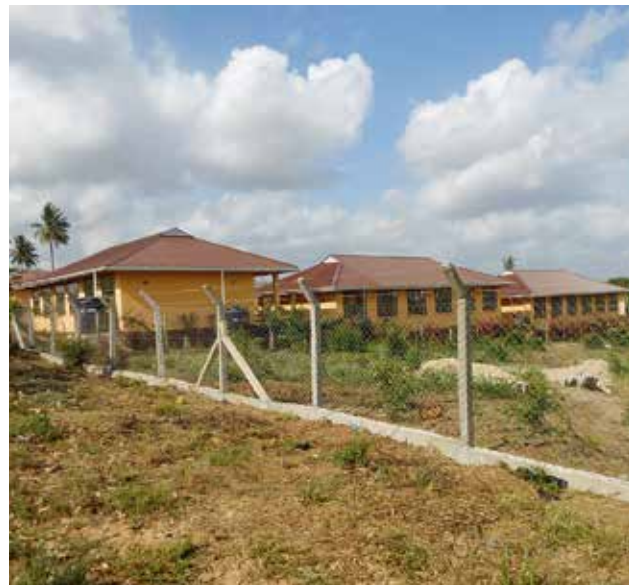
The neighbouring plot was purchased in May 2013. In the next years, it may accommodate up to eight additional classrooms.