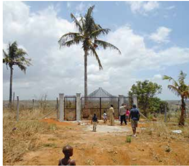
Our big plot is now surrounded by a fence. Soon, a guard house will be built and we will start to plant vegetables and fruit trees.