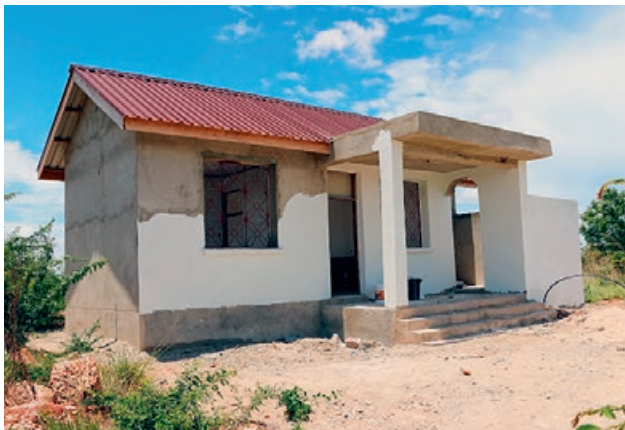
The guard house on the new property is ready to move in soon.