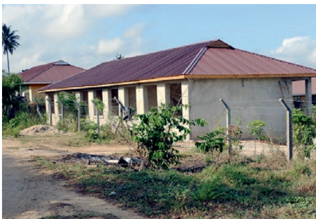
The new school building with three classrooms will be ready for occupation as planned end of the year.