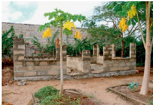
The construction of the chicken house goes fast forward.