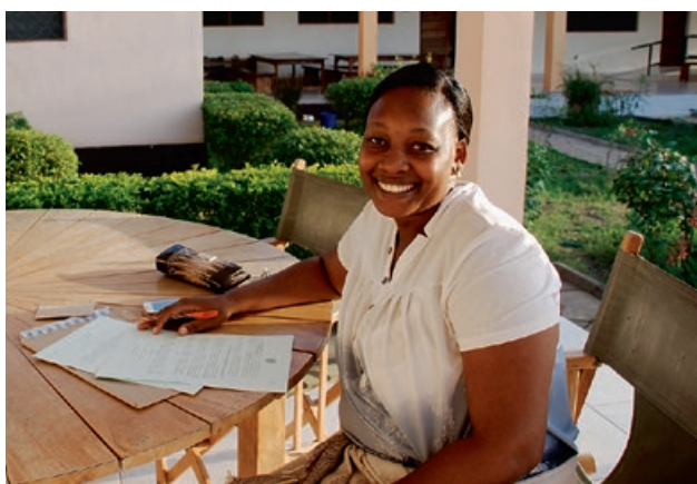
Our administrator is preparing the documents for the sale of our property in Bunju A.