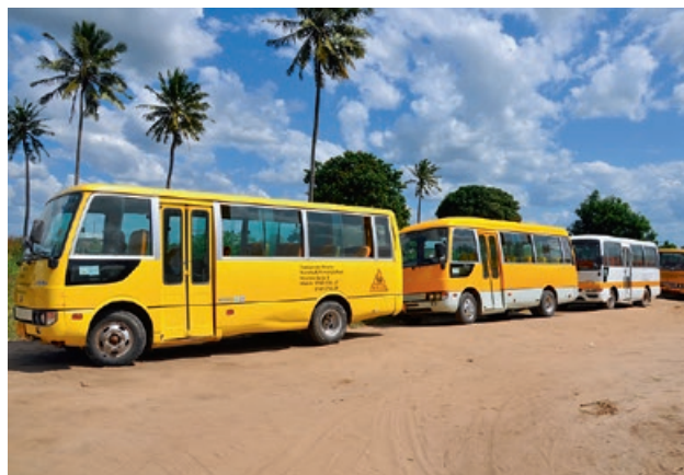
Our four school buses are ready to bring the children home.