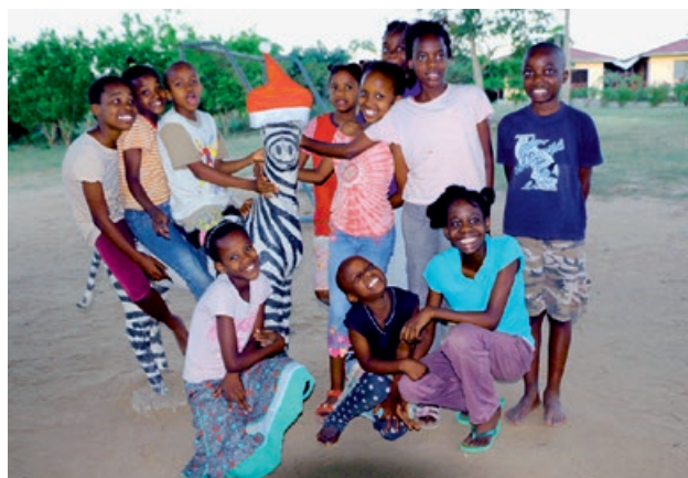
We wish all our donors and friends of Tuwapende Watoto Merry Christmas and a happy new year.