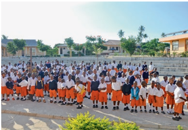
Our students at roll call on Friday morning.