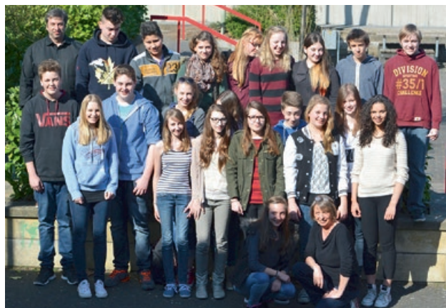
The 8 th grade and their teachers from Lindlar.