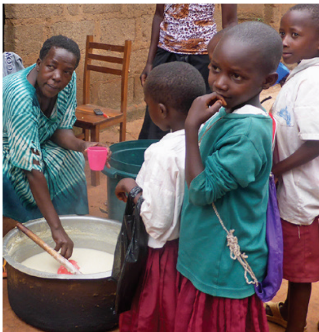
Itobo: Every day one of the cooks hands porridge out to 1000 children.