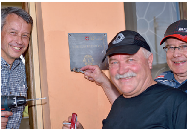
We thank the representatives from Lions Club Erlinsburg. Their presence during the opening of the water borehole was a great honor to us.