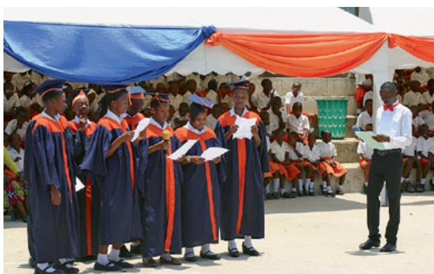
Students graduating grad seven reading their thank you letters for the parents, the teachers and the school management.