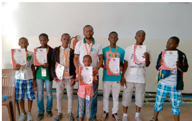
Our older boys and two children from the neighborhood with Medy Miawa, one of the best chess players in Tanzania.