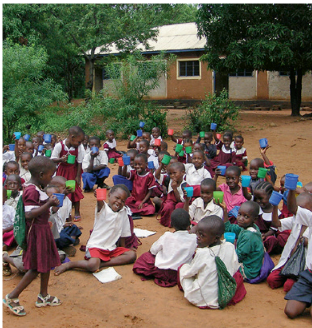
Itobe: Many children travel a great distance to attend school.