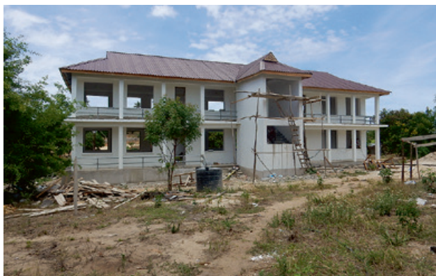
At the end of the year, the new school building with 6 classrooms will officially open.