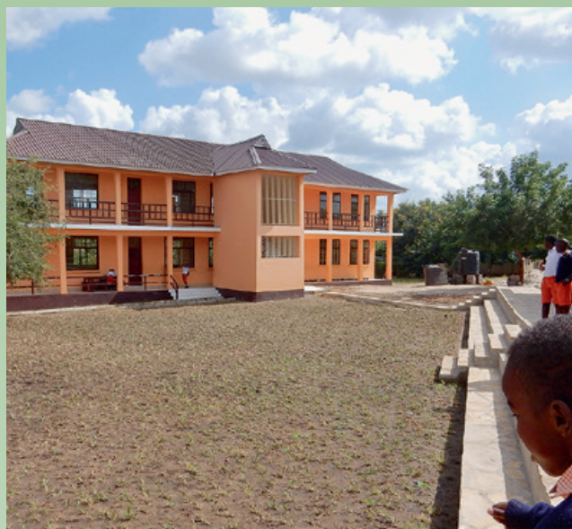
Our two-story building allows us to operate two classes per grade. In 2016 we can also accommodate our vocational and education classes temporarily.