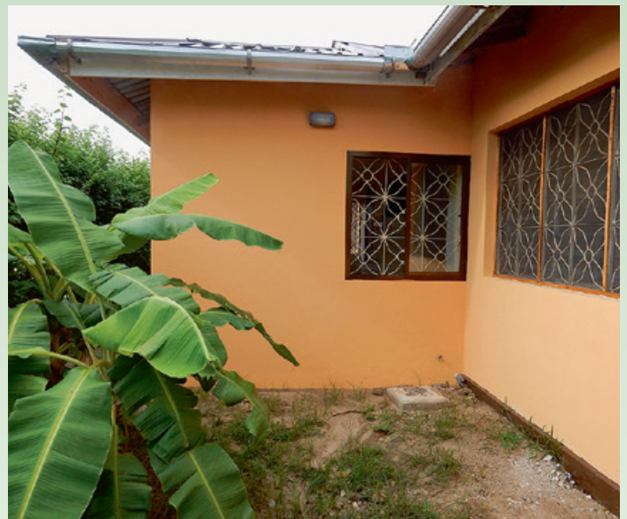
Successfully executed extension to the nursery building: toilet, shower and changing table