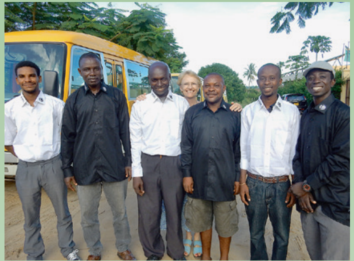
Our bus drivers are proud to wear the SCB shirts.