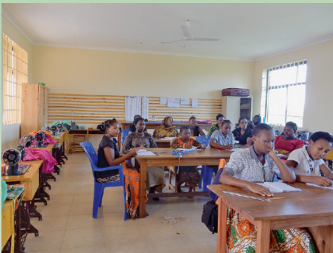
The tailoring students follow the theoretical instruction attentively.