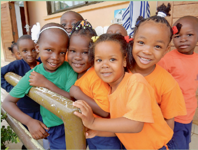
Cheerful nursery students in front of the dining hall.