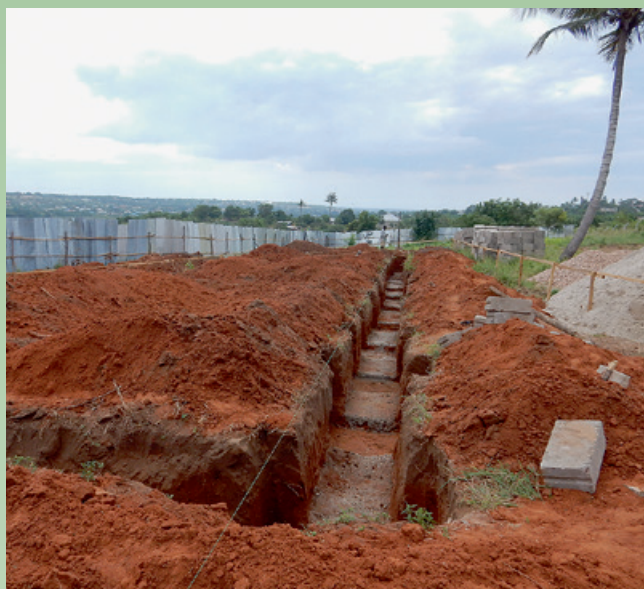
The foundation for the first building of the vocational and education training center is in progress. The building will be finished as planned end of 2016.