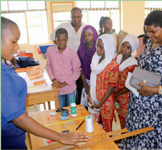
Graduation at the vocational school: Guests of honor, family members and neighbors listen carefully to the presentation of the tailor apprentice.