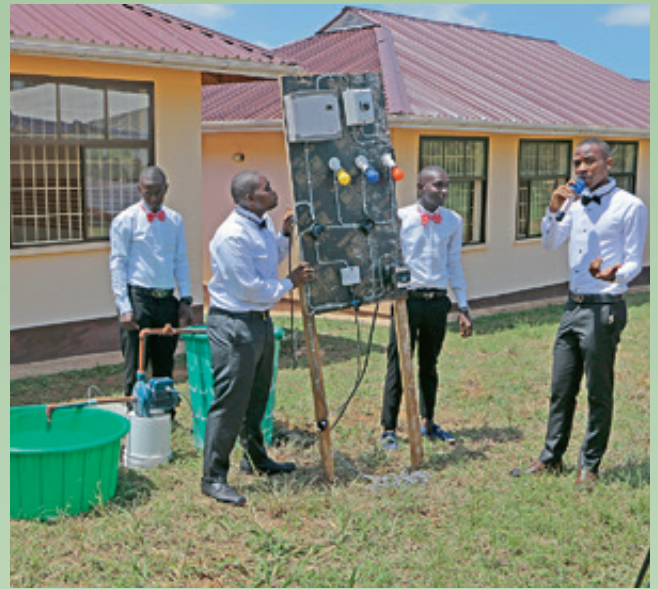
Graduation at the vocational school: The electrician apprentices proudly demonstrate their water pump station.