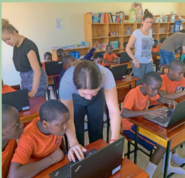
Five employees of netpulse AG decided to teach Computer Science to children in a developing country. The students worked very concentrated on their assignments.