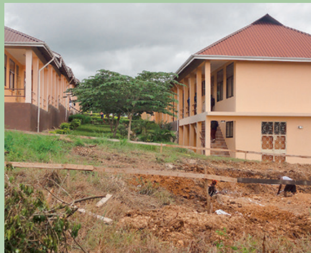
The groundbreaking for the fifth building of the vocational school was in mid-April.