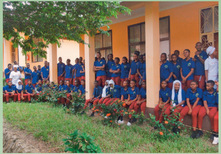
Our apprentices can choose from eight different vocational apprenticeships in the dual education system. We have workshops with an excellent infrastructure.