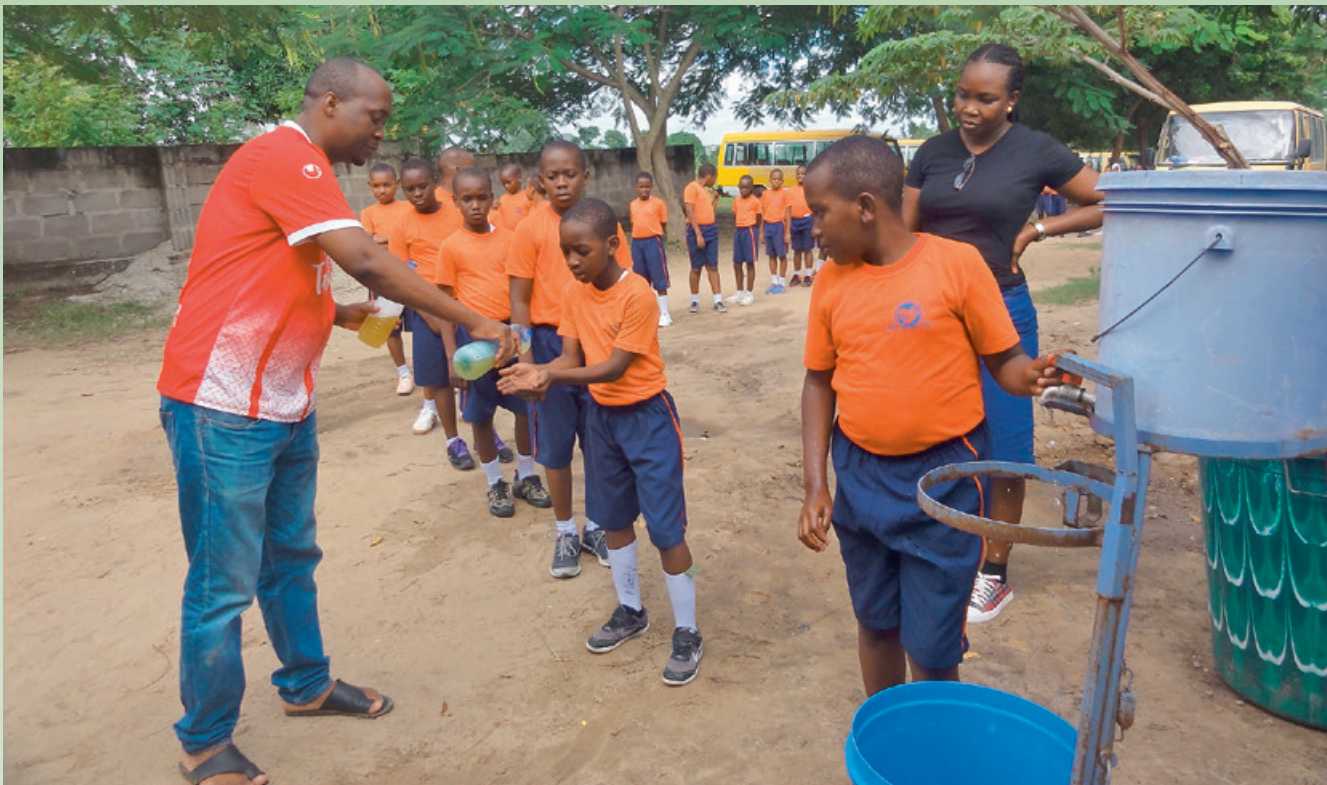
All children wash their hands with soap before class, after sports, before and after eating and after using the toilets.

The annual travel activities of the Tanzanian population during the last days of Christmas and New Year triggered a second wave of the Corona pandemic. Many people fell ill and died, especially in January and February 2021. The President of Tanzania John Magufuli also died in March 2021, officially of heart failure. Vice President Samia Suluhu Hassan took over the presidency and promises a different leadership style than her predecessor. She is reviewing the Covid-19 situation and is assuring help, both domestic and from abroad, fighting corruption and she wants to activate the natural resource management. She promotes freedom of the press and wants to create a trustworthy climate for investors and good relations with other countries. We hope that the economy will recover and more jobs will be created.