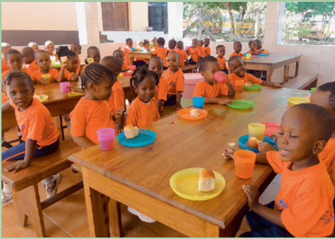
Nursery school children enjoy their snack in the new patio.