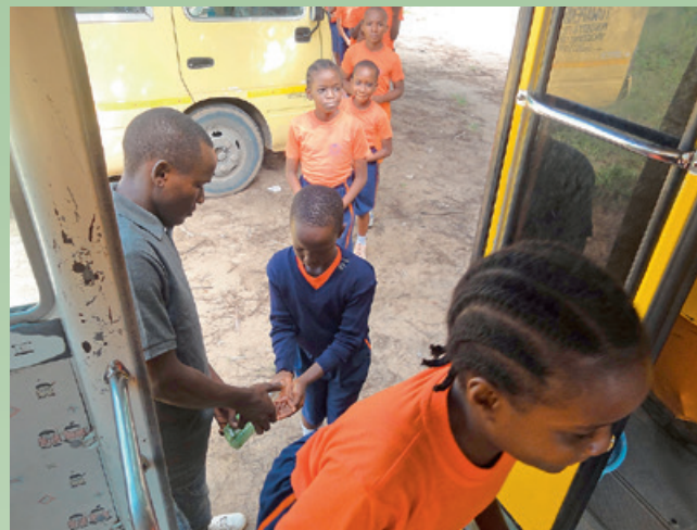
Hygiene measures are important to us. Before each bus ride, the students' hands are disinfected.