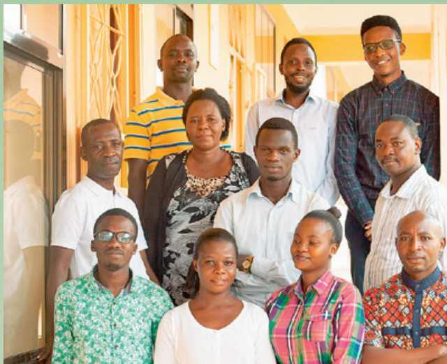
The teaching staff of our vocational school.