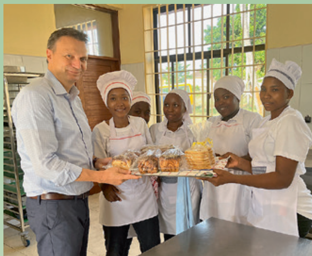
The visit to our vocational school impressed the ambassador couple. They took time to look at all the vocational school classes and talk to the learners. In the bakery, we were greeted with sweet treats by the teacher and the learners.