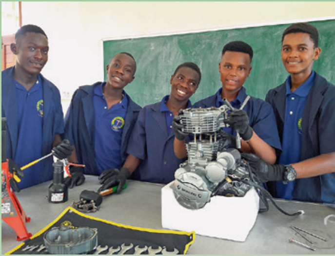
The workshop for the two-year dual vocational apprenticeship for two-wheel mechanics is very well equipped. The apprentices are motivated and look forward to practical training, which comprises 70% of the training time.