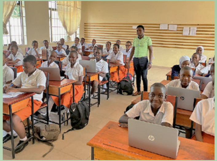
We are constantly developing. Our teachers appreciate our good infrastructure. They give their best every day for the benefit of our students.

February. The new curriculum specifies a precise timetable for the various subjects so that all classes throughout the country teach according to the same schedule. Our teachers always prepare for the new school year during the vacations. Therefore, we were all surprised by this last-minute change, which meant additional work for the teachers. Our school was chosen to invite the 348 teachers of all schools and levels of our district (Mabwepande Ward) to train and inform them about the changes.