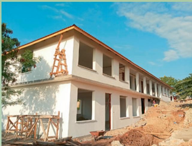
On schedule, the fifth building of the vocational school will be ready for occupancy by the end of the year. (Photo mid-October 2021)