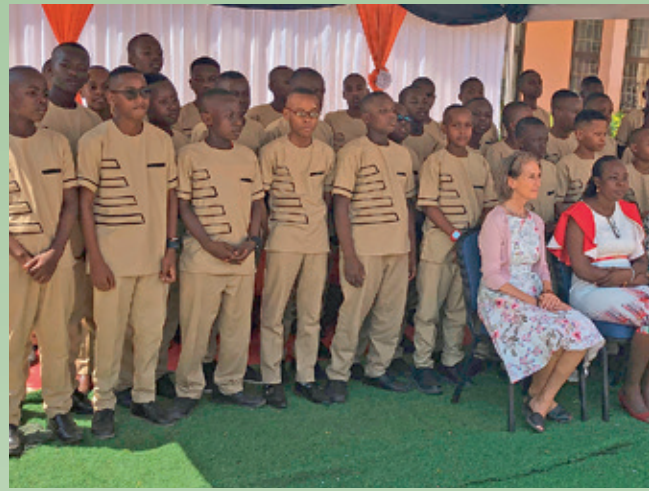
41 girls and 40 boys finished their elementary school with the school closing ceremony on September 19.

As one of the leading schools in Tanzania, Tuwapende Watoto Primary School enables all children to transfer to secondary school.