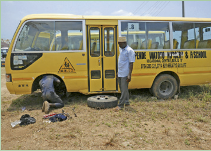
The safety of our students is important to us. School buses are regularly inspected and maintained.