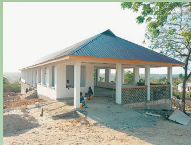
Entrance to the workshop for the dual two-year vocational apprenticeship „Two-wheel mechanics“. (Photo mid-October 2021)